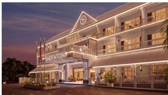
SHERATON APIA HOTEL

Three hotels have been designated by the Organising Committee. The hotels are: