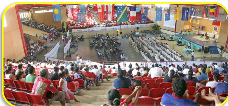
The Weightlifting Stadium in Samoa