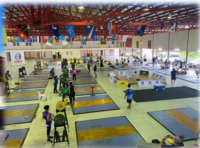
The Oceania Weightlifting Institute in Samoa where training will be held with 50 platforms available