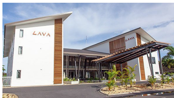
LAVA APIA HOTEL